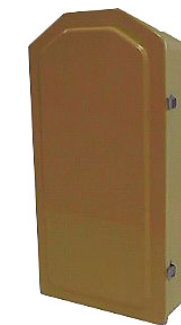
Breathing Apparatus Box BAB-3