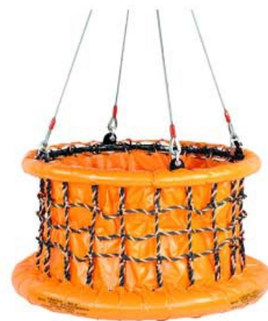
Collapsible Cargo Basket X-8CB

The collapsible work basket is a lightweight man basket for applications where OSHA requirement is not applicable.