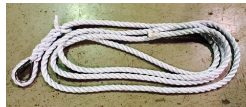
Tag Line CTL-1