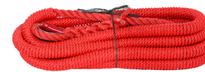
Tag Line PTL-1