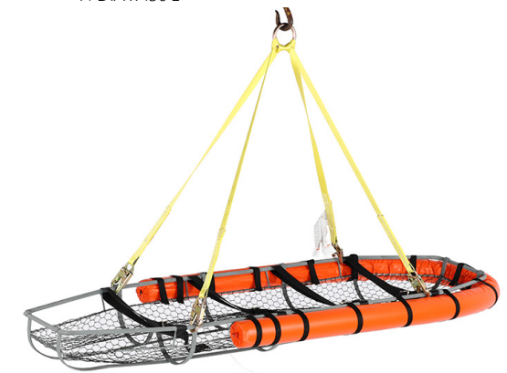
Wire Stretcher w/Accessories S-1