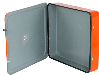
Ring Buoy Box RBB-30