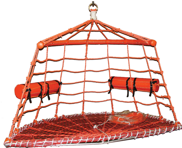
Boat Rescue Net X-544

The BPC X-544 is a boat davit or crane launched rescue system. Safe and effective for retrieving man overboard operations with the option of not putting a rescue swimmer in harm's way.