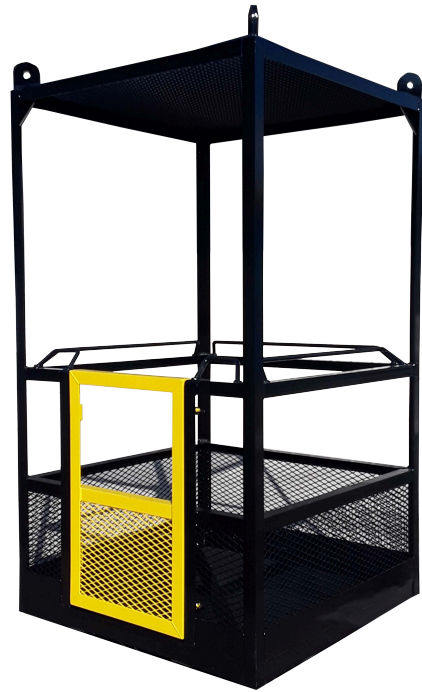
Personnel Work Basket EMB-2