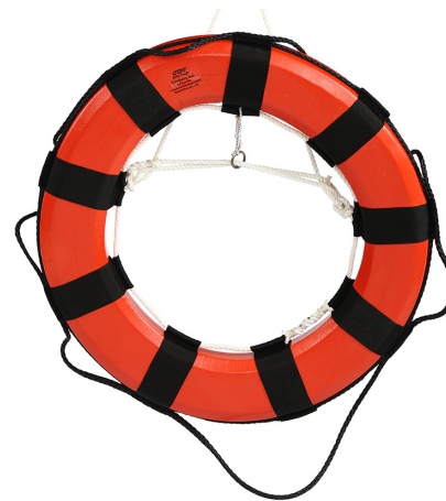
Rescue Ring RR-30