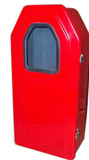
Fire Extinguisher Box FEB-1W