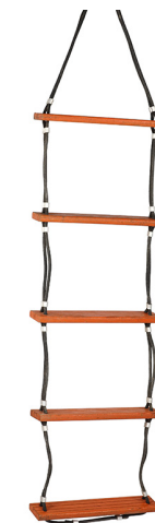
Rope Ladders WRN-18-14