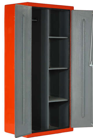
Storage Locker SL-1