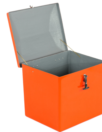
Life Preserver Box LFB-5