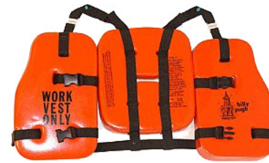
Work Vest WVO-50