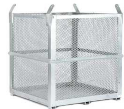
Rigid Cargo Basket 343

The DB-1 Derrick Basket is made for lifting person-nel with a lightweight basket and retractable lifeline attached to fall protection harness.