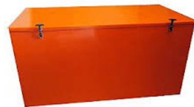
General Purpose Box OBB-200