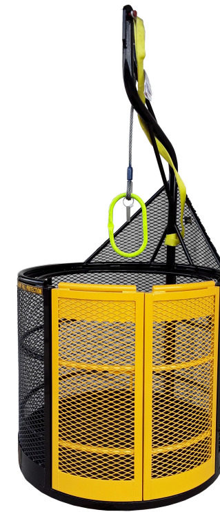
Drilling Rig Basket RGB-2