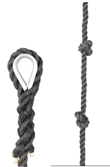
Escape and Knotted Rope