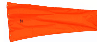
Wind Sock WS-18