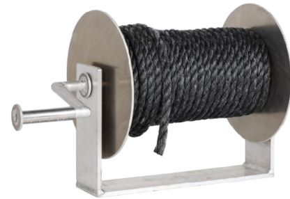
Rope Reels RR-150