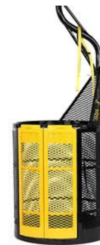
Derrick Basket DB-1

The DB-1 Derrick Basket is made for lifting person-nel with a lightweight basket and retractable lifeline attached to fall protection harness.