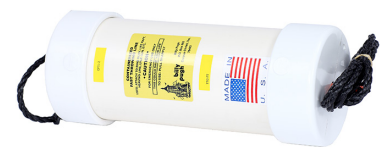
Containerized Fast Throw Line CFTL-1