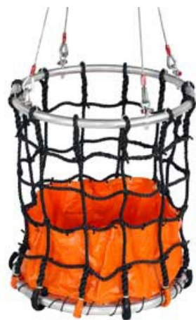
Personnel Work Basket PWB-2

The collapsible work basket is a lightweight man basket for applications where OSHA requirement is not applicable.