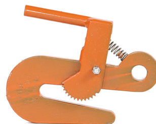
Safety Pipe Hooks SPH-03

Designed to grip pipe or casing for hands free operation.