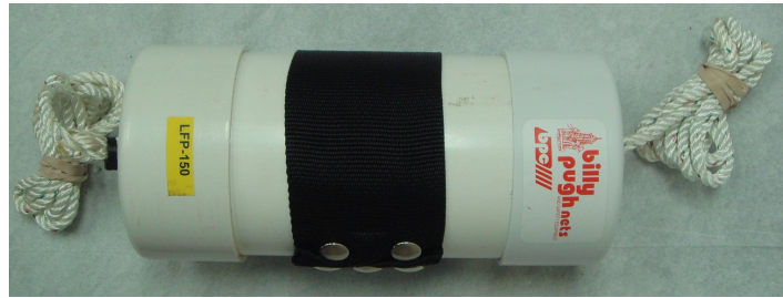
Life Float Painter LFP-150