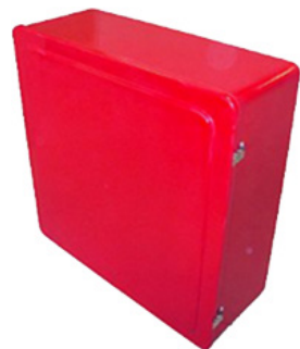
Fire Hose Cabinet FHC-300

*Specify color: red, orange, yellow or white