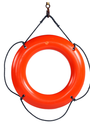
USCG Life Ring Buoy A-301