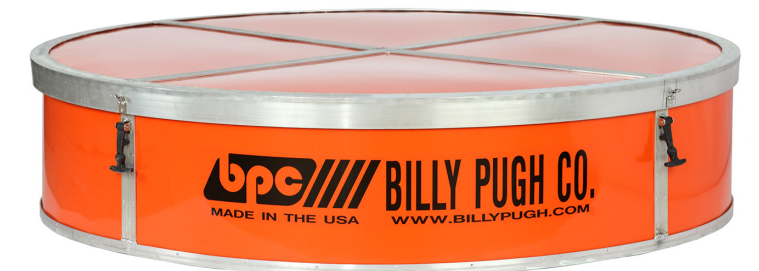
Personnel Net Box PNB-1-4