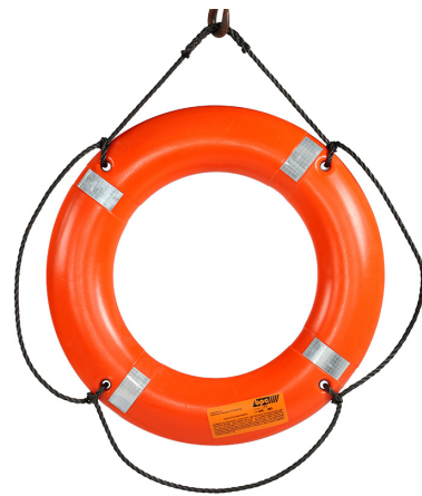
SOLAS Life Ring Buoy A-301S