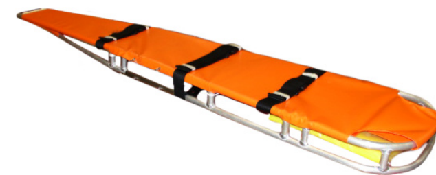
Helicopter Stretcher B-206