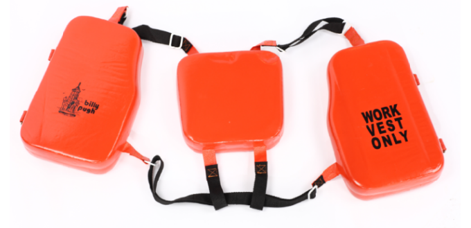
Work Vest WVO-100