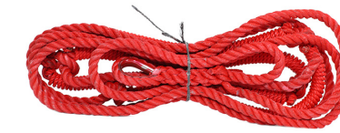
Swing SR Rope