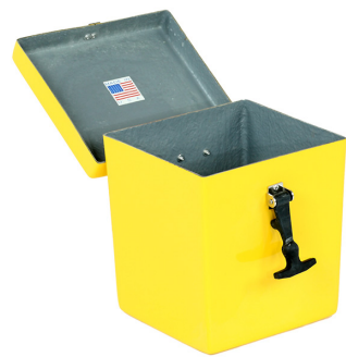
Utility Box UB-1