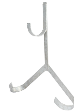
Life Ring Buoy Bracket B-30